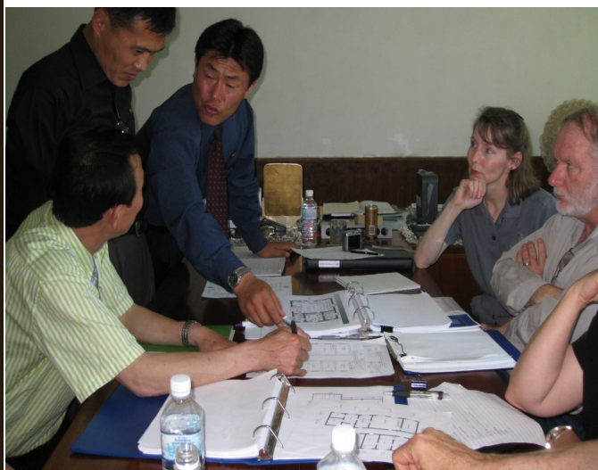
Figure 4: Site Planning Visit, May 2009

During the summer of 2010, CFK raised $49,000 in additional funds and oversaw the installation of a four-kilometer dedicated high voltage cable connecting the laboratory to the municipal power supply.