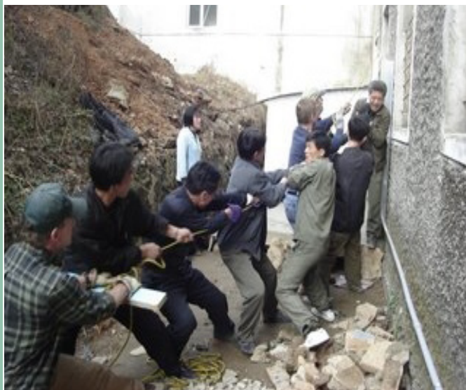
Figure 5: CFK and MoPH Work Crews Threading New Electrical Lines, November 2009

Training and technical assistance programs (November 2009–present). The Stanford/BATC team includes public health laboratory specialists from the state of California's TB laboratory system, the director of the Stanford Hospitals Clinical Microbiology Laboratory, and infectious disease faculty from the Stanford School of Medicine. Individual members of this group have extensive experience in international health, including service on WHO working committees and on advisory panels of country-based infectious