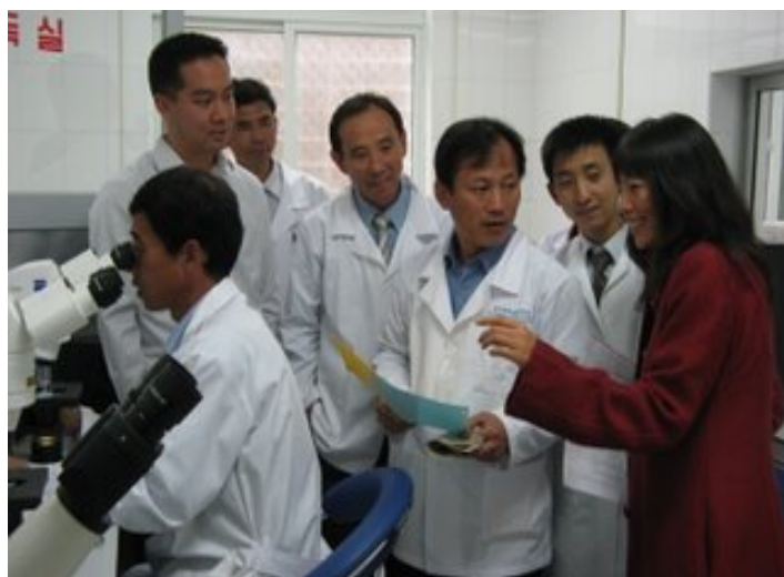
Figure 6: National Tuberculosis Reference Laboratory, Joint Bay Area TB Consortium-MoPH Training Workshop, October 2010

disease control programs. During initial site assessments, this team assisted MoPH in conducting training self-assessments and developing training curricula. Because culture and drug-resistance testing using conventional systems can require more than three months to yield results, the Stanford/BATC team also recommended training in more rapid detection systems recently approved by WHO for resource-limited settings. 62 Since November 2009, a total of nine BATC laboratory trainers have conducted two five-day training workshops in collaboration with MoPH physicians and laboratory technicians ( Figure 6 ). These sessions have covered basic safety procedures, inventory maintenance, and culture and drug susceptibility testing using rapid as well as conventional testing systems. The team also works closely with CFK's biomedical engineer and a clinical laboratory professor from Andrews University. Additional workshops and training exchanges are planned for 2011.