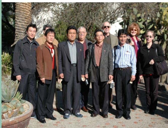
Figure 2: MoPH Delegation at Stanford University, 12 January 2008

During these discussions, MoPH representatives, led by the director general of the No. 2 and No. 3 (TB and Hepatitis) Departments, requested assistance to complete a modern TB reference laboratory at the campus of the No. 3 (TB) Prevention Hospital in the capital city of Pyongyang. Although WHO and MoPH had devised a site plan and equipment inventory for this project in 2006, the initiative had since stalled for lack of funds. 61